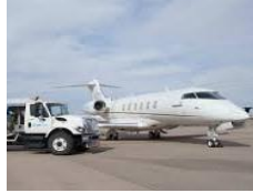
Aviation Fuel Sales