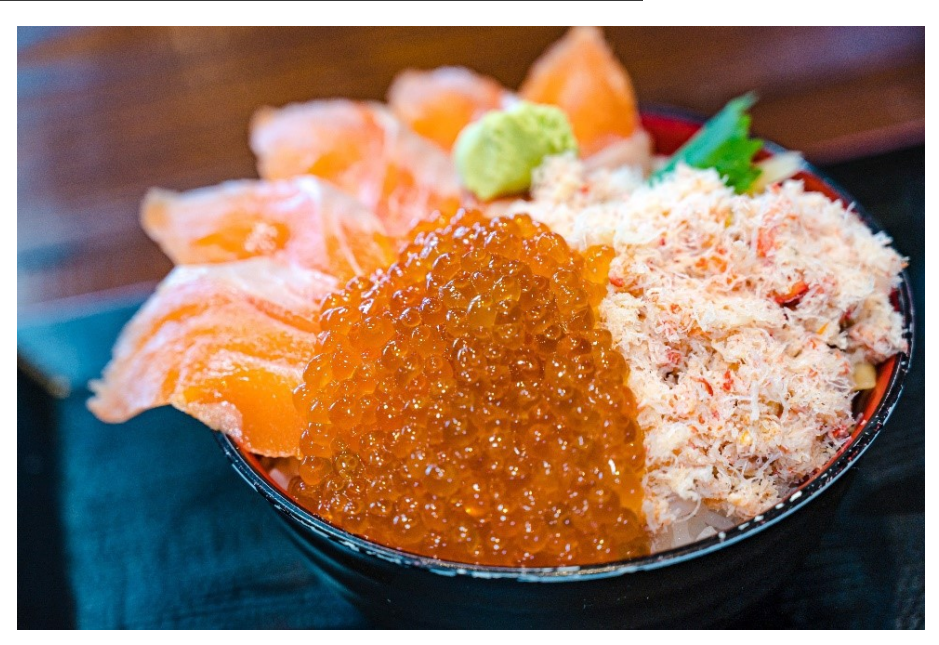
It's the season for delicious seafood!! Why don't you select the port town of Hakodate for your next trip?

In winter season, there are many delicious seafoods in Japan, such as oyster, crab, salmon roe, sea urchin, yellow tail and more.