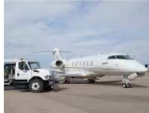
Aviation Fuel Sales